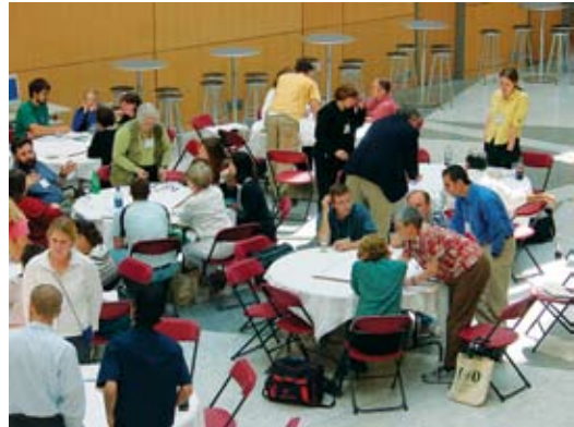
Figure 3. Photo of teams conferring at the Mapping Campus–Community Collaborations conference held in 2004 at Ohio Wesleyan University.

Projects developed at the 2004 conference are typically initiated by liberal arts faculty, staff, and students. We will highlight several of these conference projects (from among the hundreds in existence worldwide) as representative examples as we review important tenets of GIS and service-learning and partnership building. One year after the conference, some of the projects were established and productive, while others were stalled—not unusual for community collaborations.