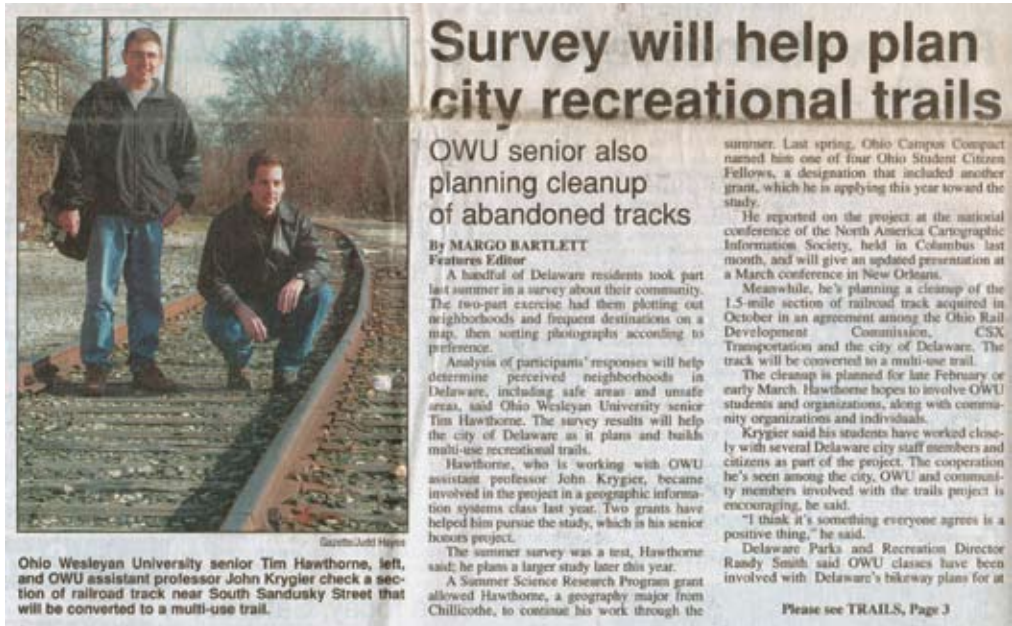
Figure 1. Newspaper article about the Ohio Wesleyan recreational trails project.

Since 2001, community members and the recreation department in Delaware, Ohio, have been collaborating with students and faculty from Ohio Wesleyan University (OWU) to develop a system of networked bicycle paths. Using GIS and GPS, we are researching, mapping, and analyzing a system of bicycle paths that connect neighborhoods, schools, commercial areas, and recreational facilities throughout the city (figure 1). The City of Delaware Recreational Trails Project has benefited